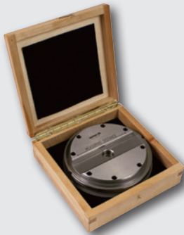
Control ruler, MacroMagnum