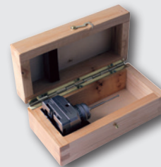
Measuring probe, Macro