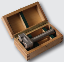
Control rod, Macro